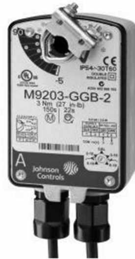
M9203-xxx-2(Z) Series Electric Spring-Return Actuator